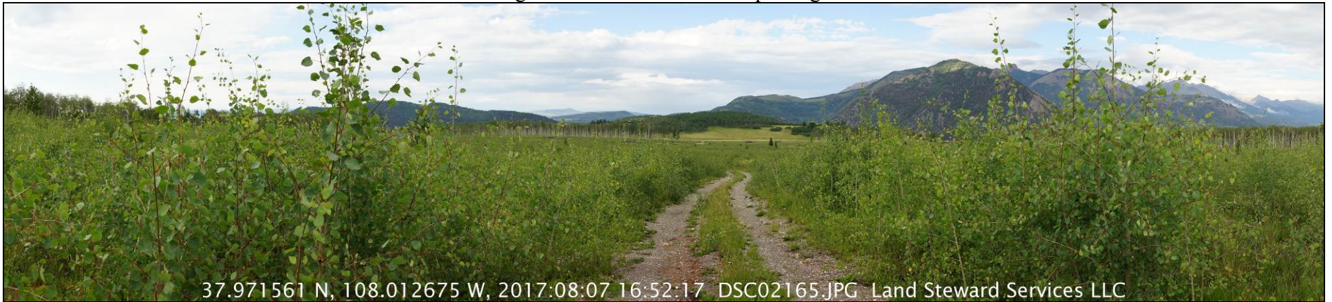
Extra 2: Looking northeast in the fenced aspen regeneration area.

37.971561 N, 108.012675 W, 2017:08:07 16:52:17 DSC02165.JPG Land Steward Services LLC