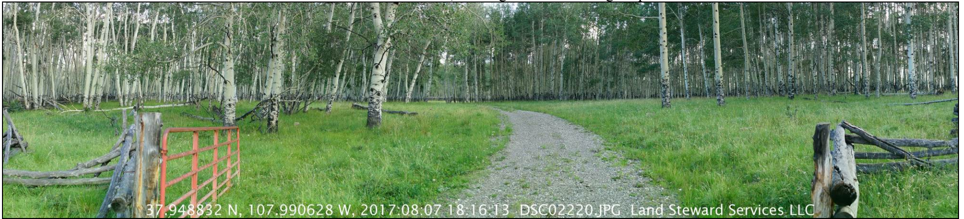
PP3: Near the southeast border, looking south into a large aspen stand.

37.948832 N, 107.990628 W, 2017:08:07 18:16:13 DSC02220.JPG Land Steward Services LLC