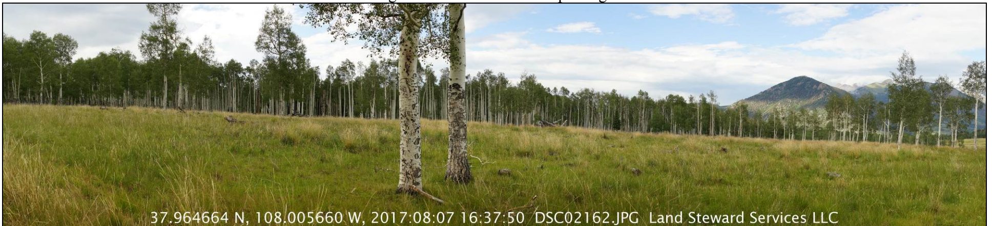
Extra 3: Looking north in the unfenced aspen regeneration area.

37.964664 N, 108.005660 W, 2017:08:07 16:37:50 DSC02162.JPG